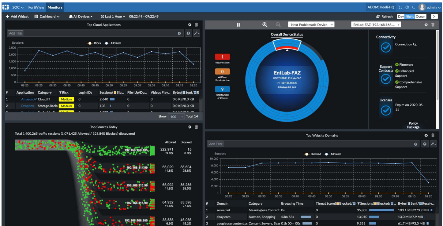
Figure 2: FortiManager dashboard view.

The unique, single-platform approach of Fortinet’s NGFW solution delivers end-to-end protection that is easy to purchase, deploy, and manage. Single-pane-of-glass security management and visibility helps to simplify the problems of multiple complex consoles. This centralization enables true automation-driven network management with features for flexible deployment. A highly intuitive view of applications, users, devices, threats, cloud service usage, and deep inspection provides unparalleled transparency of what is happening on the network at all times. With this strategic view, one can easily create and manage more granular security policies designed to optimize security and the allocation of network resources.