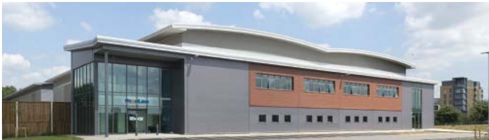
Starline’s UK-Based Manufacturing Facility

Another main factor that drove Fujitsu’s decision was its need to incorporate a flexible metering offering. It was important to the team that options for both wired and wireless metering, which could be directly integrated into the tap offs, were available. “Having a flexible metering option, where we could install wired or wireless meters was very useful,” adds Simon.