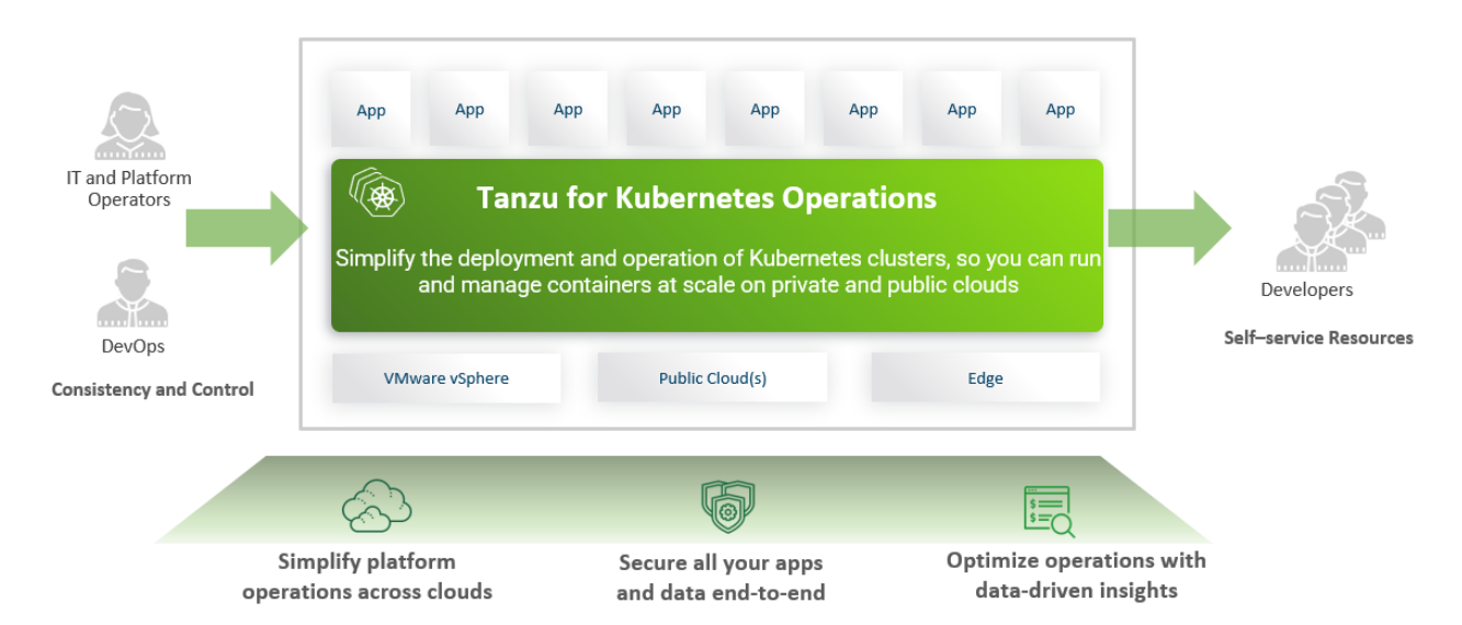
Figure 2. Tanzu or Kubernetes Operations