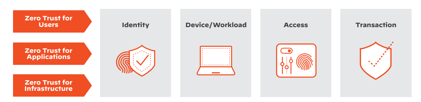
Figure 1: Each pillar requires validation across identity, device/workload, access, and transaction

Everything infrastructure-related—routers, switches, cloud, IoT, IIoT, HMI, PLCs, etc., and supply chain—must be addressed with a Zero Trust approach.