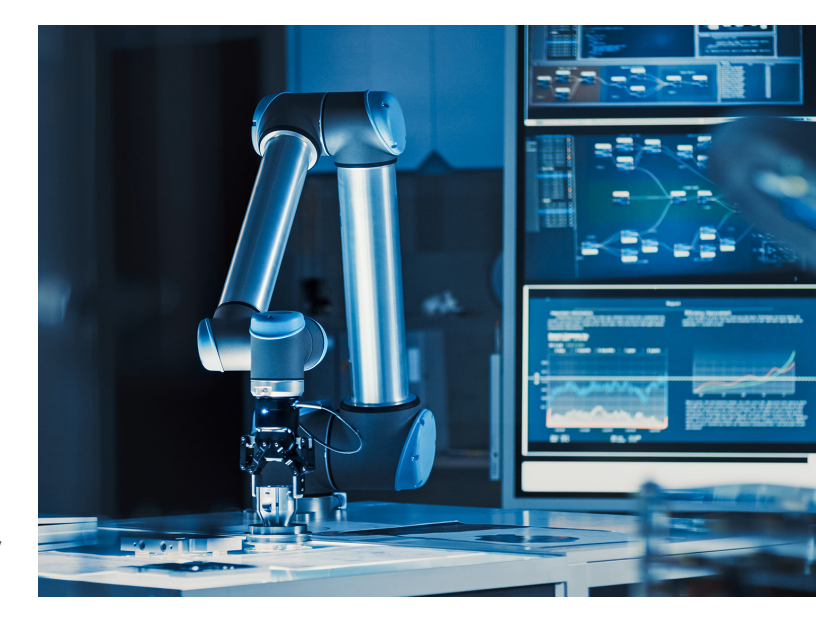
Figure 1 | Prowess Consulting evaluated how to streamline IT operations for an Al-driven inspection system

We focused our analysis on Dell™ PowerEdge™ servers because these servers are purpose-built for edge and AI use cases, offer intelligent automation for management, and are cyber-resilient, offering zero-trust capabilities. These PowerEdge servers also support sustainable computing through power-efficient performance.