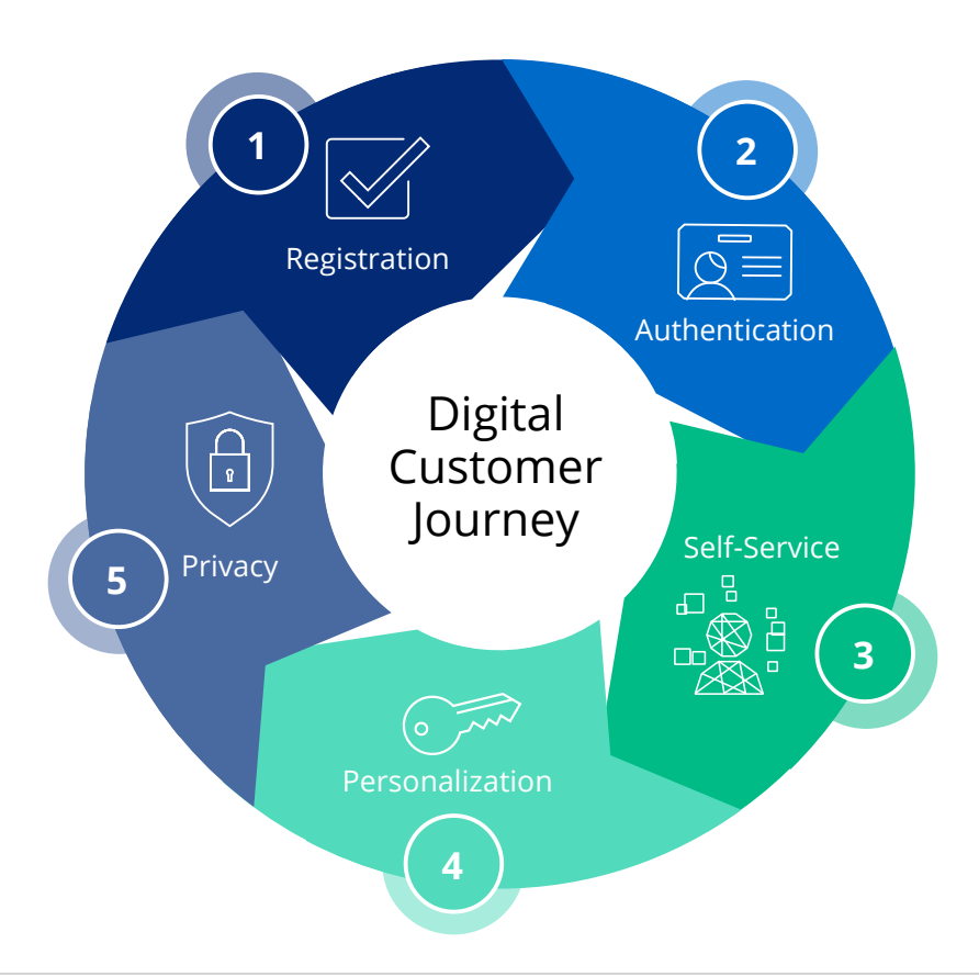
Figure 1: ForgeRock CIAM ensures that customers can move seamlessly and securely across all stages of the digital customer journey.

The ForgeRock CIAM solution meets organizations wherever they are in their digital customer journey and enables them to start modernizing immediately. The solution offers hybrid capabilities that enable organizations to seamlessly integrate, centralize, and manage identities and data across on-premises, cloud, and as-a-service infrastructures.