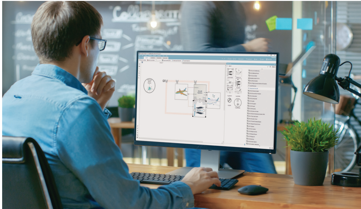
Simcenter Amesim provides a set of off-the-shelf physical libraries that can very easily be extended with a customer's own industrial property.

The issue is how this all works together: the whole does not necessarily equal the sum of its parts. Unlike a complicated system, a complex system is not devisable into a set of isolated subsystems. It is a system or unit itself. And this is the core of the issue. In the quest to make lighter, more economical and greener aircraft, the aircraft system function has become more integrated and interconnected with various onboard software programs that control the aircraft.