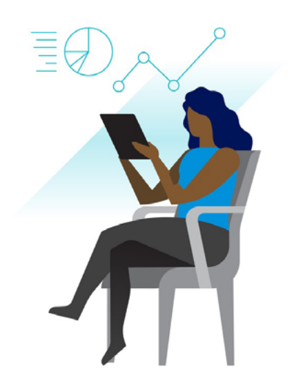
TABLE 1: Impact on IT and business agility.<sup>6</sup>

6. IDC White Paper, sponsored by VMware. "The Business Value of Running Applications on VMware Cloud on AWS in VMware Hybrid Cloud Environments." October 2020.