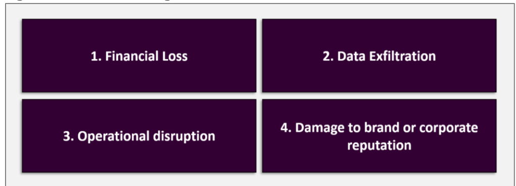
Figure 3: The Four Categories of 'Material' Incident