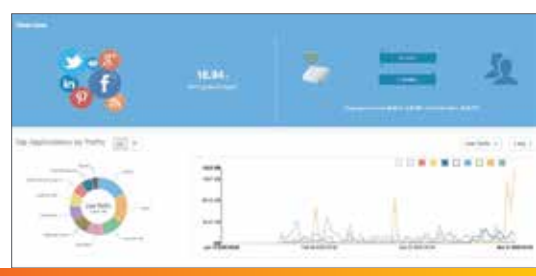
Figure 4: Application