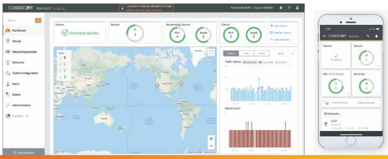
Figure 5. RUCKUS Cloud Web UI and mobile app

CommScope pushes the boundaries of communications technology with game-changing ideas and ground-breaking discoveries that spark profound human achievement. We collaborate with our customers and partners to design, create and build the world's most advanced networks. It is our passion and commitment to identify the next opportunity and realize a better tomorrow. Discover more at commscope.com