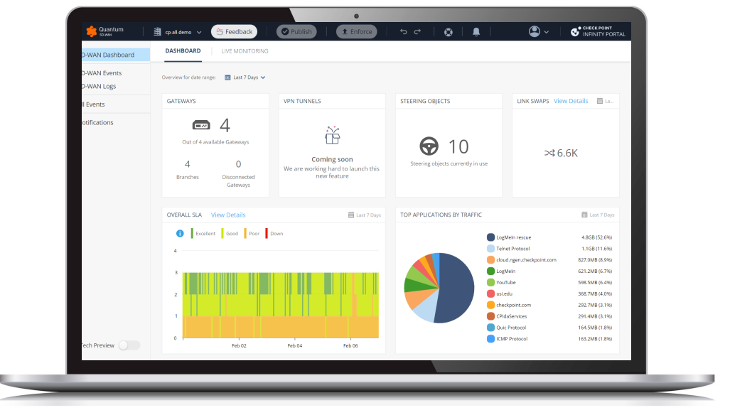
Figure 1 Quantum SD-WAN Dashboard