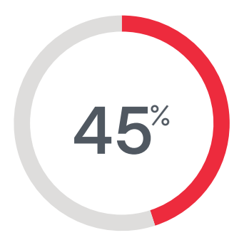
of production data was affected by cyber attack*