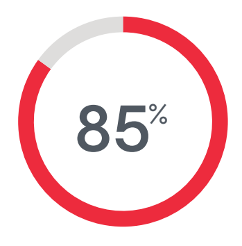
of organizations were hit by a ransoware attack in 2023*

Preventing malicious access to this data should be the top goal of any cybersecurity plan. However, no organization should assume that their defenses will always hold. Therefore, having the ability to recover data as the last line of defense is equally important. Of organizations affected by ransomware, on average 15% of production data was lost (2023 Veeam Ransomware Trends Report), highlighting the importance of having a well-designed and reliable data recovery plan.