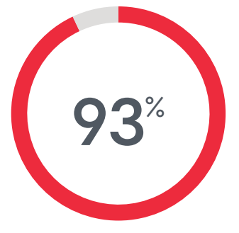
of ransomware attacks targeted backups*